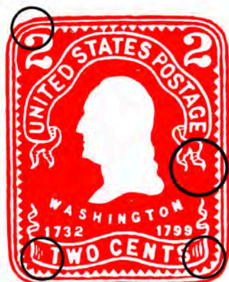
TYPE 43 3/Wh, Am, B1, Bu; 10/Wh; 13/Wh, Am, B1, Bu.